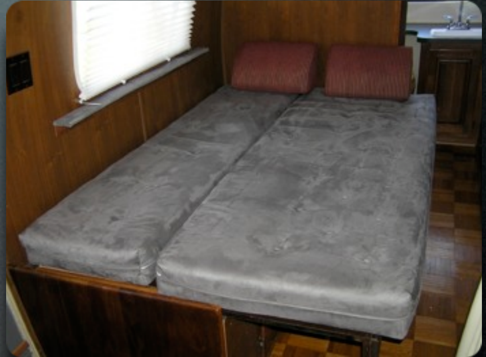
Standard size of a double bed