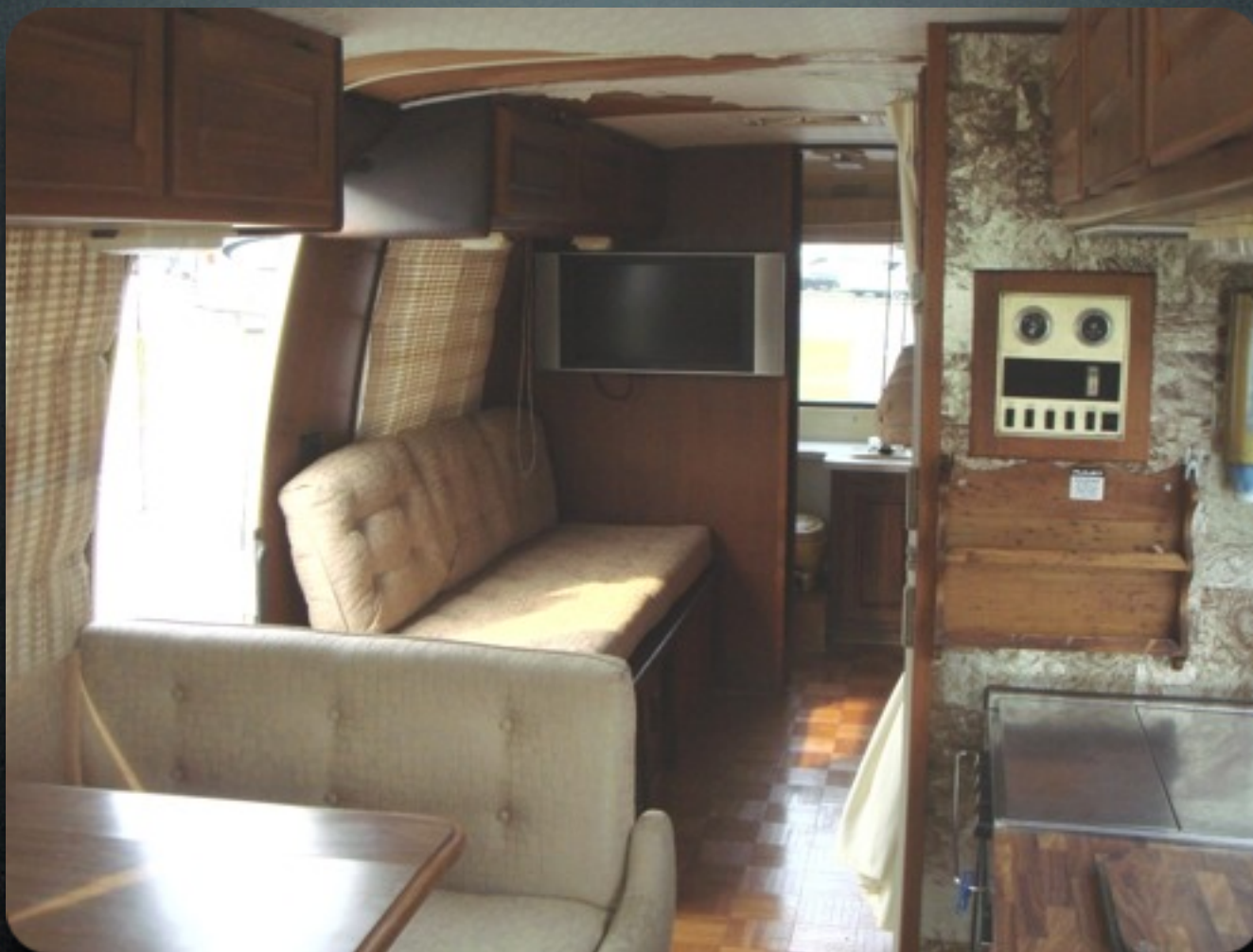
Original interior, with headlining coming off