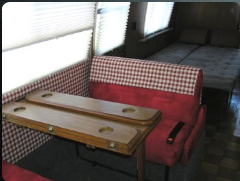
The dinette - red MicroSuede and gingham checked cloth