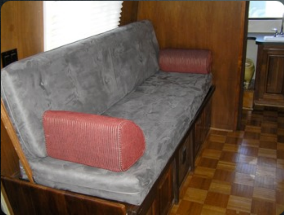
Byron's idea of a jack-knife couch