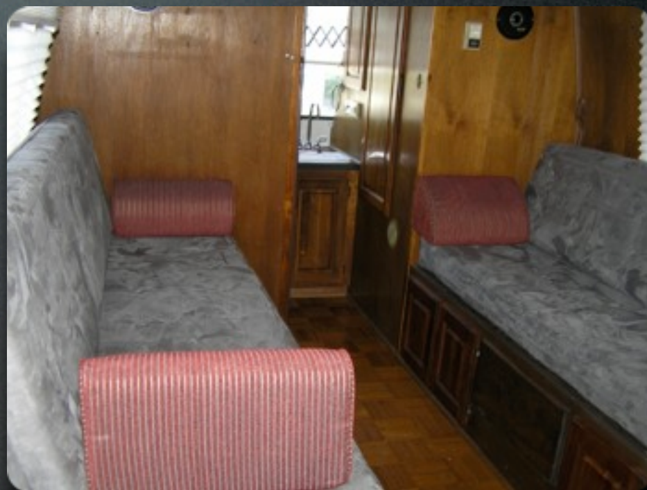
Living/bed area - gray MicroSuede and striped bolsters