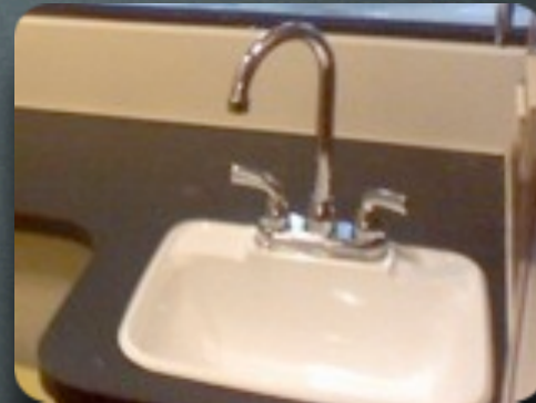
Faucet and sink in bath, driver and passenger seat with tilting backs