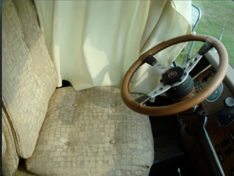
Driver seat, original upholstery, third-party steering wheel