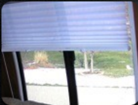
Cooktop, faucet, sink, countertop, wall covering, and day/night shades