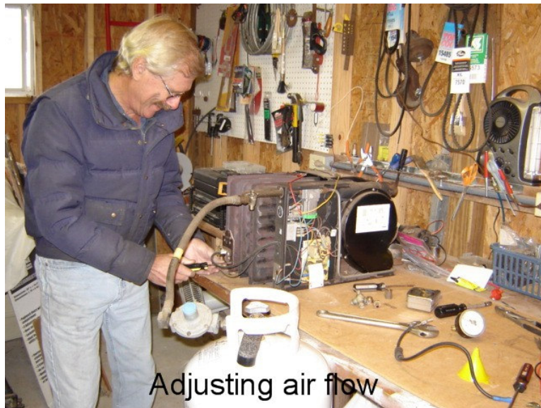
Adjusting air flow